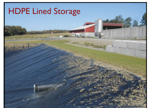
HDPE Lined Storage

trient loading to the Salmon Creek watershed by collecting all runoff from the feed storage area. The Cayuga County SWCD is performing routine stormwater inspections and hydro-seeding behind construction crews to stabilize the site and prevent any erosion.