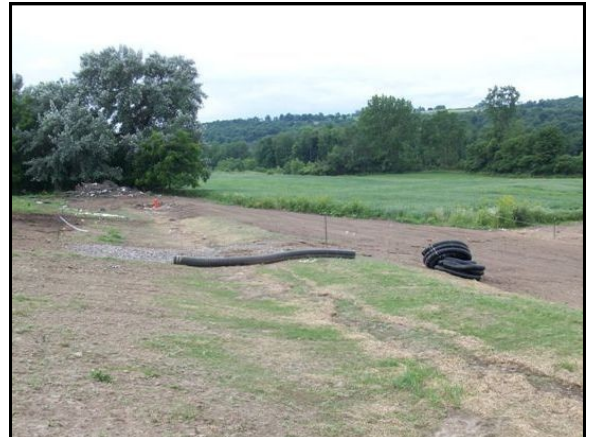
Bassett Farm in Genoa, NY

Through NYS Department of Agriculture and Markets Ag-Non Point funding, the District recently completed a drainage project at the Bassett Farm in Genoa in the Cayuga Lake Watershed. Excessive surface and subsurface water on the farm created many issues. Working with the landowner, the District installed a grassed swale, surface inlet and over 1500' of drainage tile to remediate these problems.