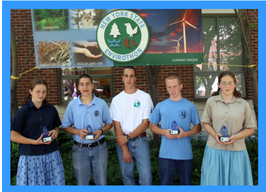
2012 Orange County Mount Academy

The NYS Envirothon took place on May 23rd and 24th, 2012 at Hobart & William Smith College in Geneva, NY. The winning team as shown to the left: The Mount Academy Team from Orange County will be moving on to the Canon Envirothon in Selinsgrove, PA on July 22nd-28th, 2012. Congratulations team and good luck at the Canon!