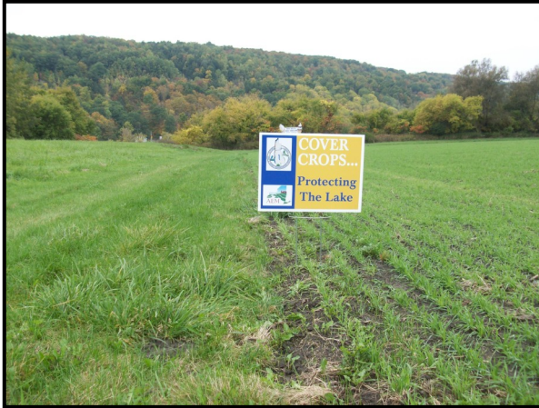
▲ Above: 80 acres of Winter Rye Cover Implemented in Owasco Flats.

Below are pictures of Cover Crops implemented using Ag. NonPoint Source Funds, winter cover reduces need for fertilizer at planting while improving the soil structure, organic matter, biological activity and reducing soil erosion to sensitive water courses.