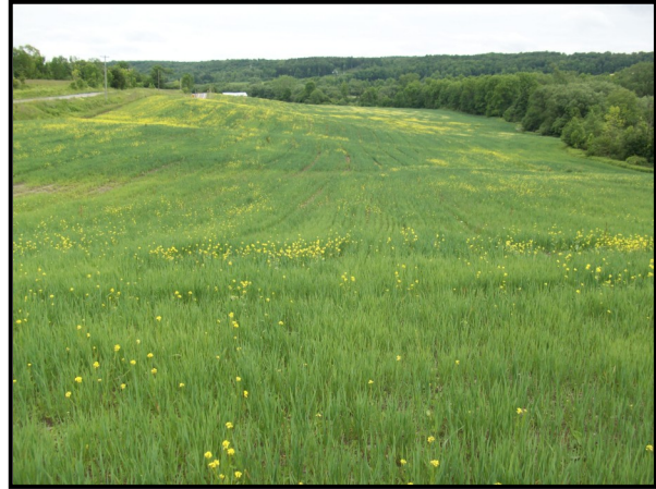
▲ Above: 25 acres of Oats and Red Clover used for Cover in Dutch Hollow Watershed.