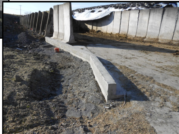
Right: New curb diversity bunk silo runoff from a clean water surface inlet.