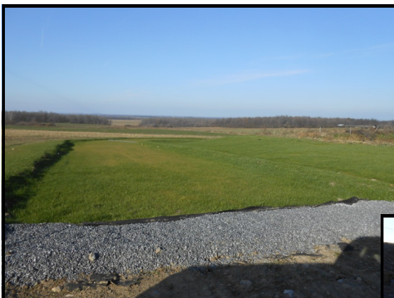
Left: Vegetated treatment area with a gravel lip spreader.

In October District equipment operators and technicians completed the VTA, the drip trench, approximately half of the low flow collection system, and the gravel base for the curbing. The farmer contributed in-kind services to complete the forming and pouring of the curb. The remainder of this project will be completed in 2013.